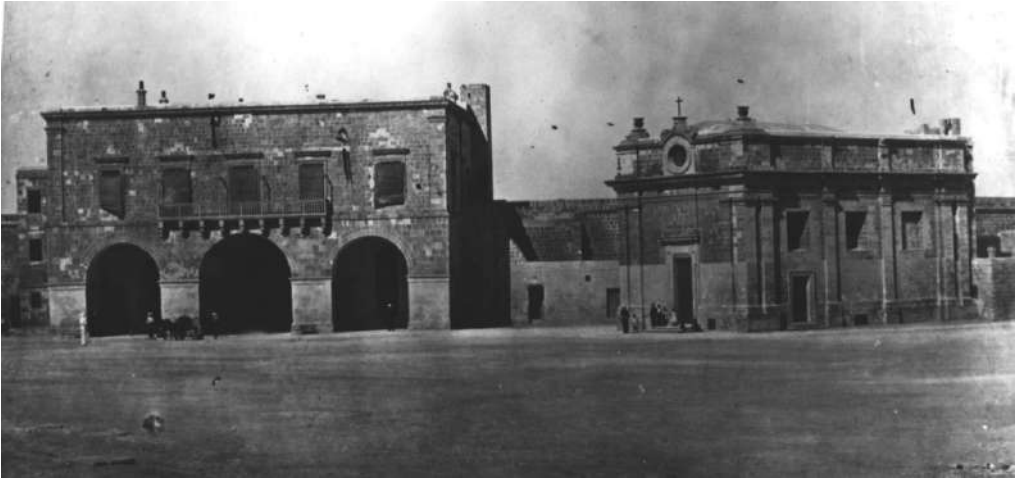
Figure 1: Image showing St Nicholas Church on the right-hand side and the Governor's house on the left-hand side