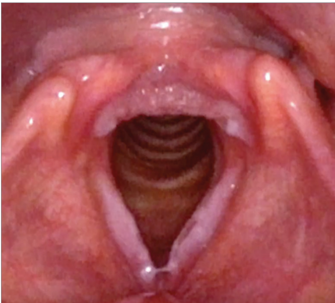
Fig. 2. The exophytic leukoplakia „cauliflower-like” in white light endoscopy.

ters has been codified by Hirano [6] and Dejonckere [7]. They are the symmetry and periodicity of glottic vibration, glottic closure, profile of vocal fold edge, amplitude of vocal fold vibration and mucosal wave. Six other parameters for an essential and complete laryngostroboscopic evaluation (supraglottic framework behaviour, seat of phonatory vibration, vocal fold morphology and motility,