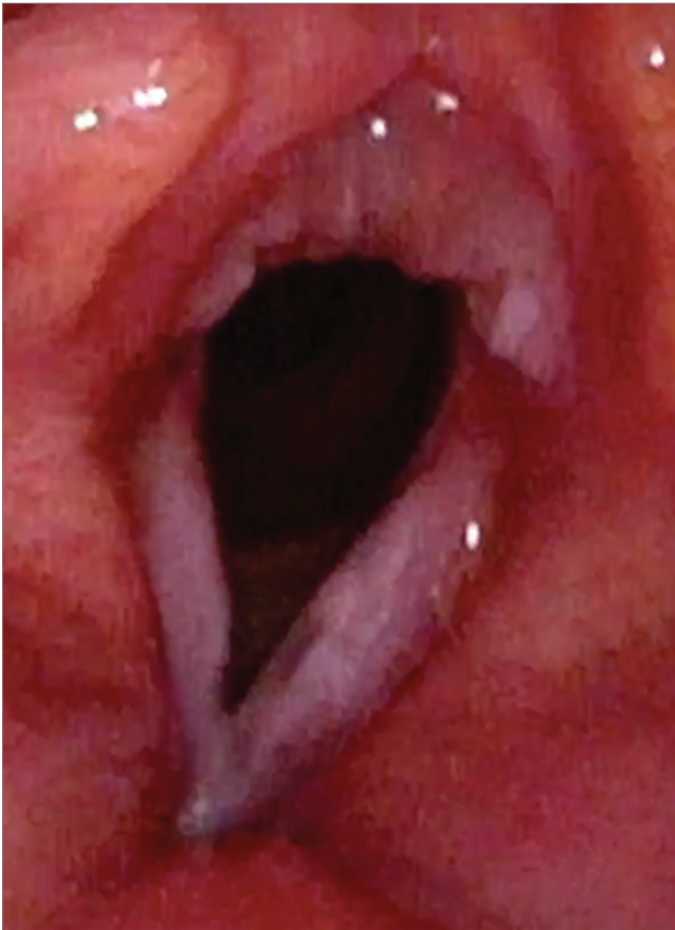
Fig. 1. The exophytic leukoplakia „cauliflower-like” in white light endoscopy.