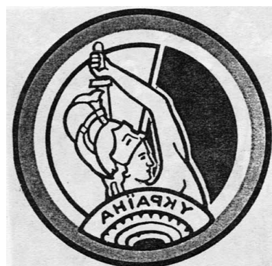
Figure 3. Coat of arms of "Ukraina" Lviv [4].