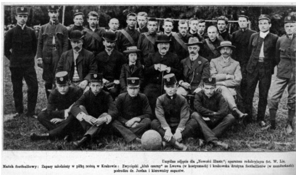
Figure 5. Dr Henryk Jordan surrounded by „Czarni” Lwów players and the Cracow students’ team – 4 th June, 1906 [13].