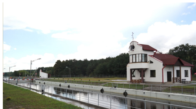
Fig. 1. Water junctions no. 10 “Załużie” on the D-BC

The above concept has been implemented since 2015. In particular, design and preparation works are being carried out for the construction of shipping lock no.3 Ragodoszcz. The total cost of reconstruction and locks’ construction on the eastern section will amount to EUR 19.5 million.