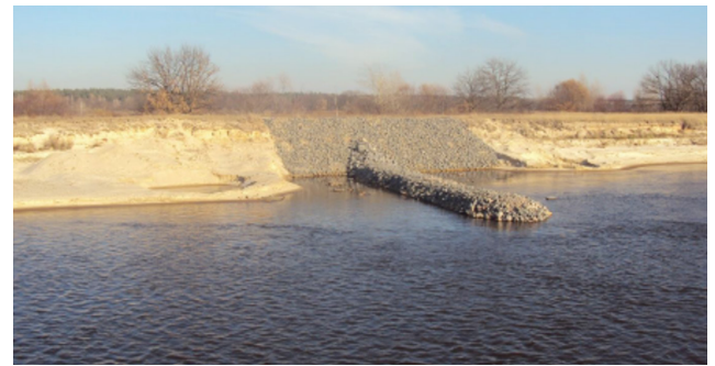
Fig. 2. Example of a side-spur on the Pripyat river

Analysis of the Pripyat river’s longitudinal profile indicates that even full implementation of hydrotechnical works required to improve the fairway will not allow full use of vessel