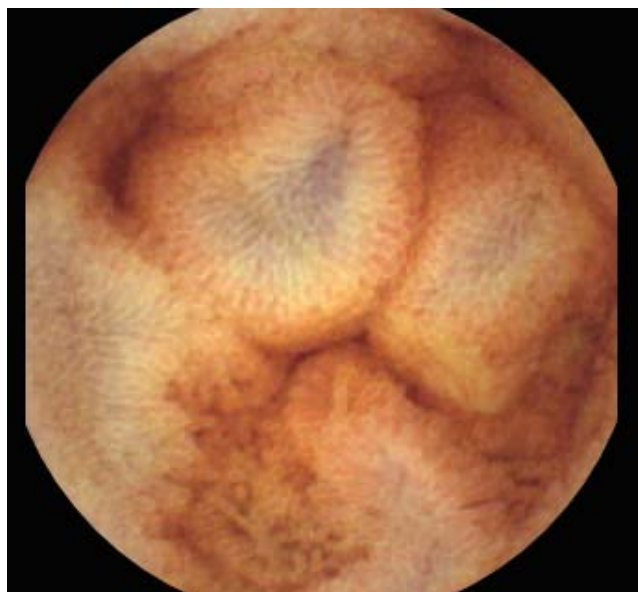
Figure 5. Villous oedema and small-bowel varices.