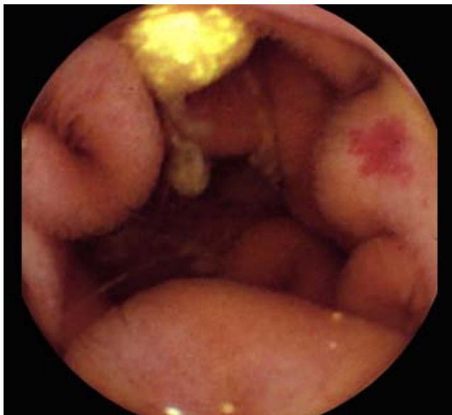
Figure 1. A nodular lymphangiectasia and a P2 angiectasia.

ALD: alcoholic liver disease. GTT: gastric transit time. MELD: score Model for End-stage Liver Disease. NAFLD: non-alcoholic fatty liver disease. ns: non-significant. PBC: primary biliary cirrhosis. PHC: portal hypertensive colopathy. PHG: portal hypertensive gastropathy. SBTT: small-bowel transit time.