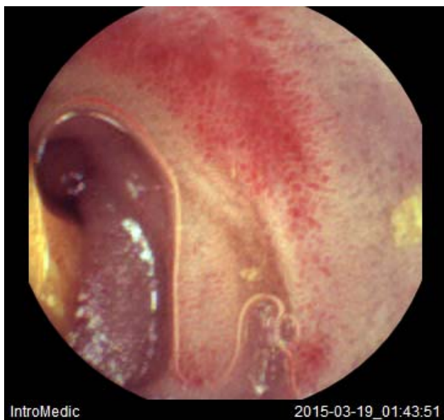
Figure 4. Multiple cherry red spots.