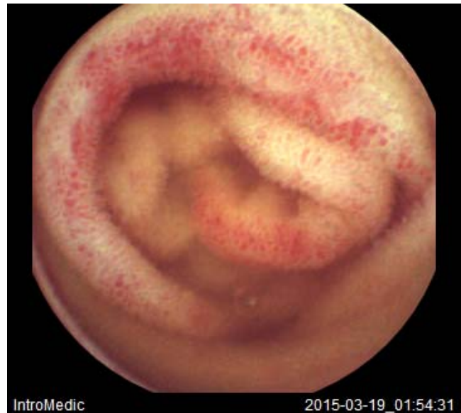
Figure 2. Multiple cherry red spots and villous oedema.