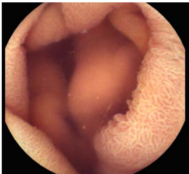
Figure 3. Villous oedema and mucosal oedema.